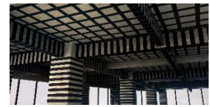
Curing and protecting