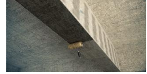
Applying epoxy resin adhesive