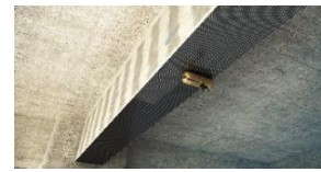
Applying adhesive again